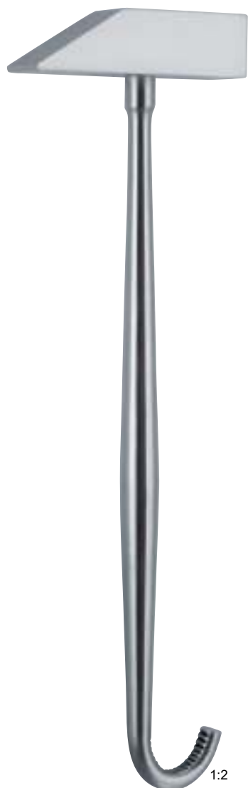
270 mm – 10 3 / 4 " LMI 54110-00