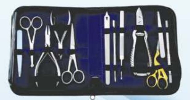
Ref-1688 Manicure Instruments Kit Set of 12 Pcs