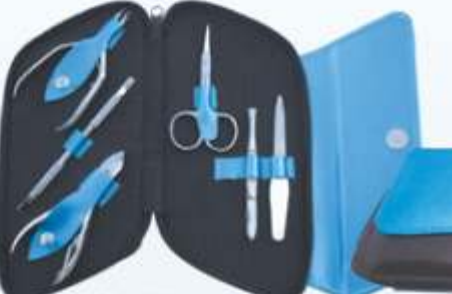
Ref-1685 Manicure Instruments Kit Set of 6 Pcs