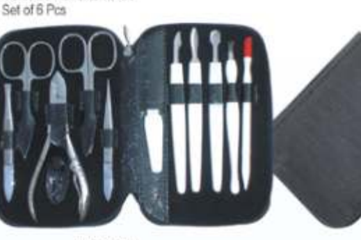
Ref-1692 Manicure Instruments Kit