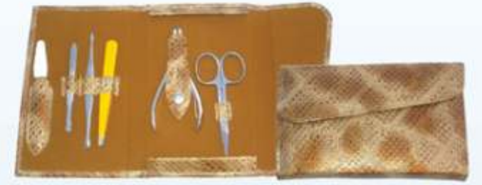
Ref-1686 Manicure Instruments Kit Set of 6 Pcs