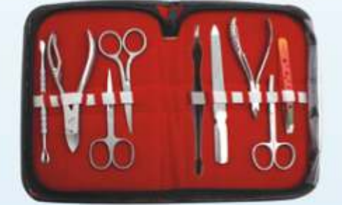
Ref-1687 Manicure Instruments Kit Set of 9 Pcs