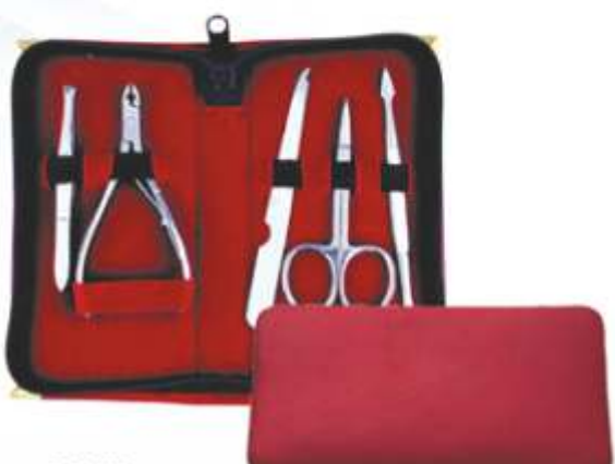
Ref-1682 Manicure Instruments Kit Set of 5 Pcs