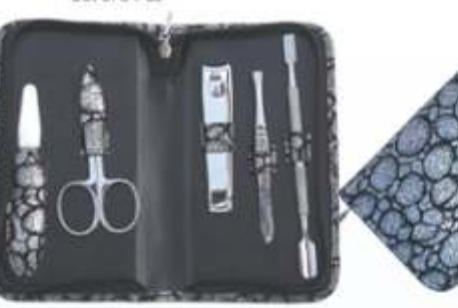
Ref-1691 Manicute Instruments Kit for 5 Instruments