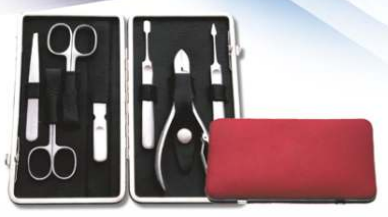
Ref-1681 Manicure Instruments Kit Set of 7 Pcs