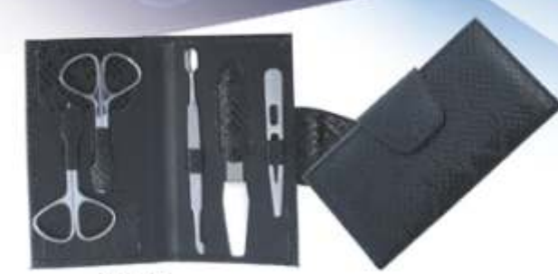
Ref-1689 Manicure instruments Kit Set of 5 Pcs