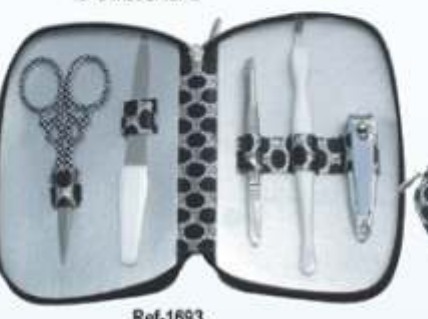
Ref-1693 Manicure Instruments Kit for 5 Instruments