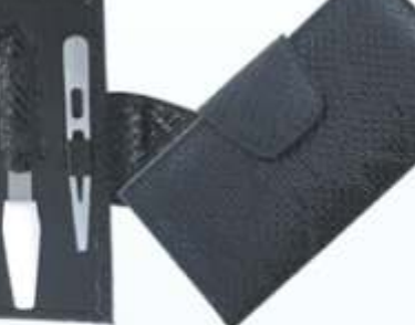
Ref-1683 Manicure Instruments Kit Set of 5 Pcs