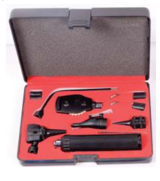
ENT Diagnostic Set Black Colour in Box Packing.