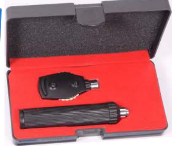
Balck Colour Coated in Box Packing.