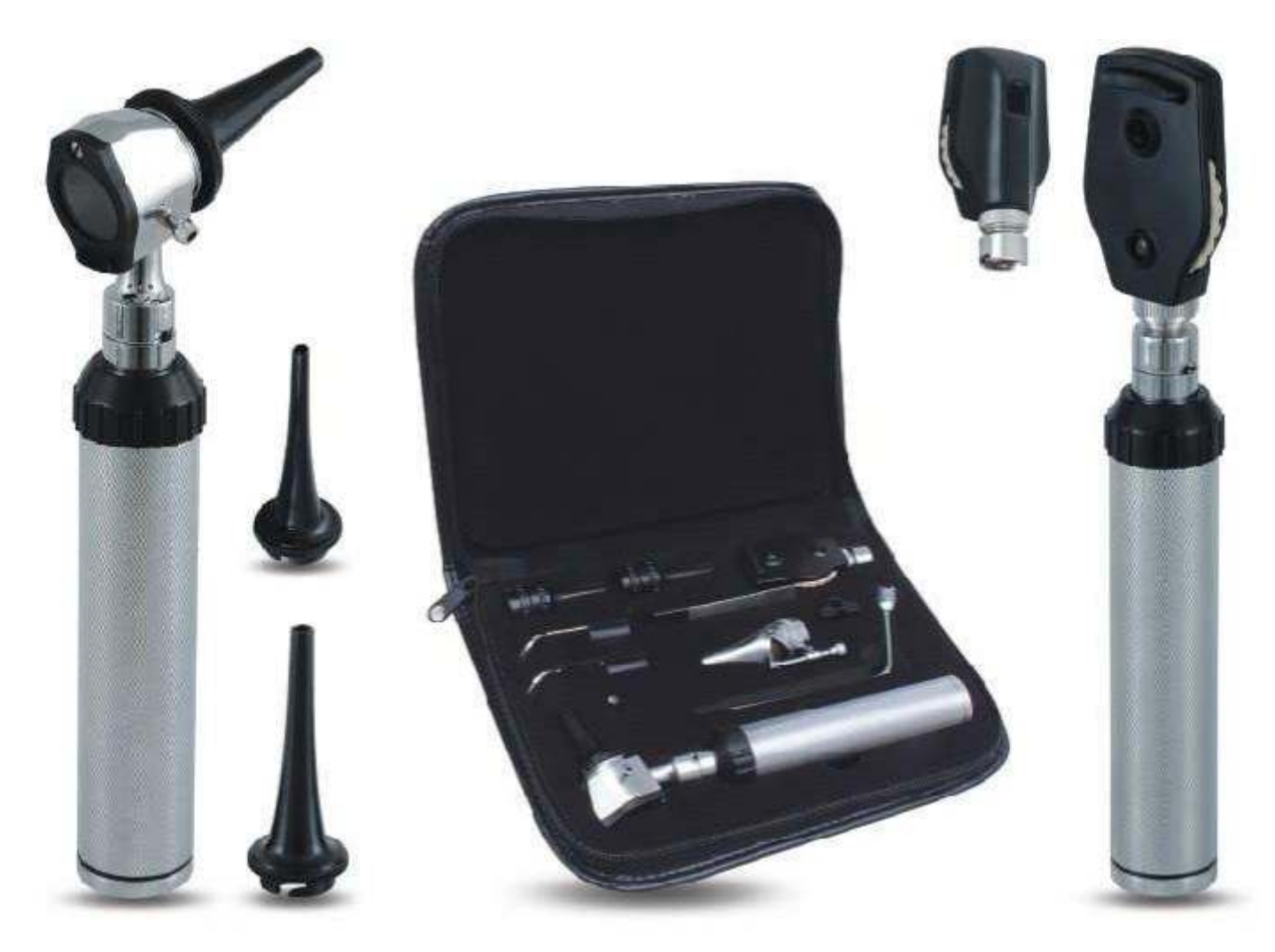
LMI-1008-0 Brass Otoscope Fiber Optic Brass Otoscope Conventional