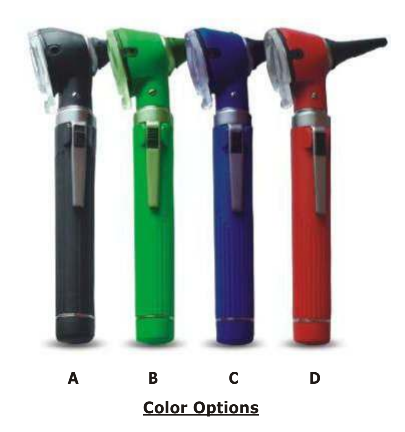
LMI-1011-0 Mini Otoscope Fiber Optic Complete Set of Disposable Cannulas