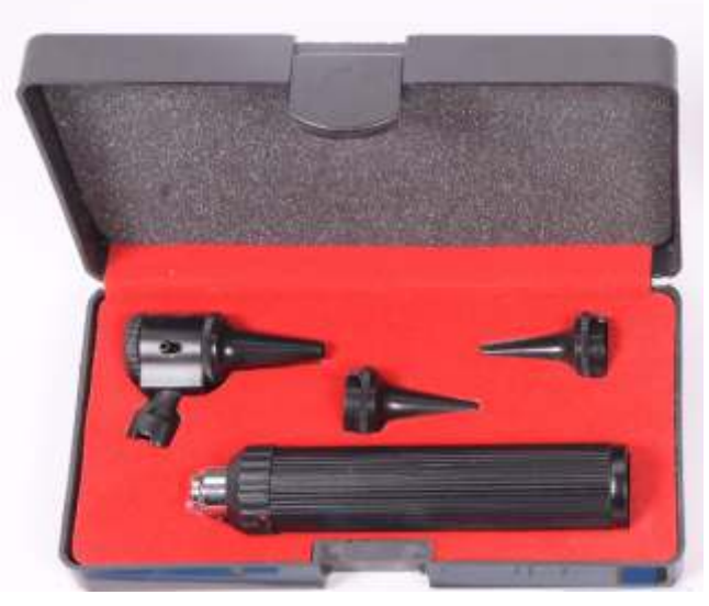
Diagnostic Otto scope Set Black Colour Coated in Box Packing. LMI-1031-0

Manufacturer & Exporter all kinds of Surgical, Dental Instruments